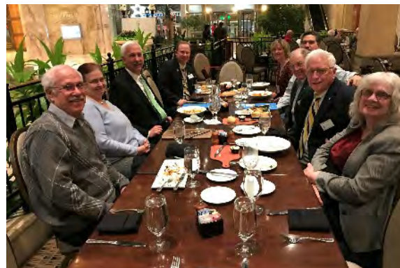
Compatriots and spouses above after the Saturday night banquet; Compatriots gather at Washington's statue in the Old Hall of the State Capitol after the Awards Ceremony (upper right photo); Compatriots at the chapter dinner at Trevi's on Friday night (lower right photo)